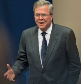
Former Florida Governor Jeb Bush's appearance at the annual Mississippi College Scholarship Banquet produced the most attendance in the banquet's history. In past years, other speakers have included Condoleezza Rice, Stephen Forbes, Bob Dole, and Mike Huckabee.